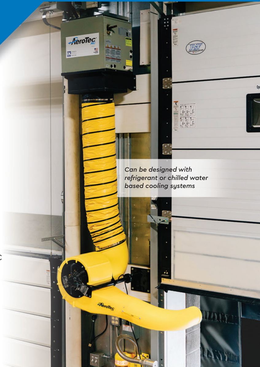
Can be designed with refrigerant or chilled water based cooling systems